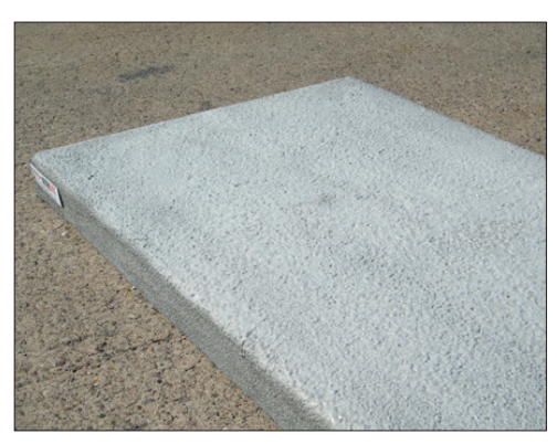
STEP 1 Position the lightweight slab in the required location of the ASHP unit.