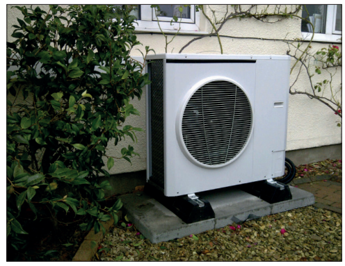
STEP 5 Secure the ASHP units onto the kit - the installation is complete.