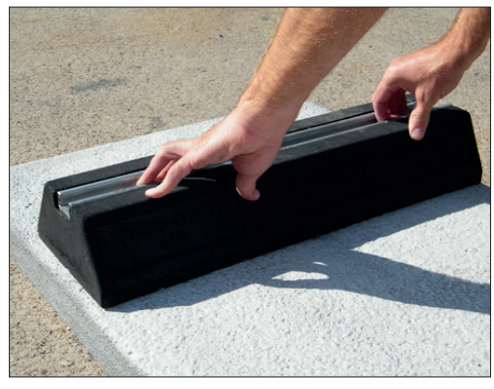
STEP 2 Place both feet on the lightweight slab to match the pitch of the feet.