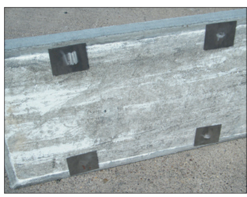
STEP 3 Insert all four base plates through the lightweight slab and reposition to the required location of the ASHP unit.