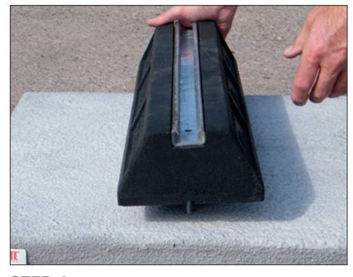
STEP 4 Place both feet onto the threads and secure with nuts and washers.