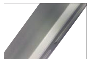
PROCESS FOUR Epoxy polyester powder coating