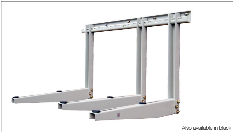
Also available in black

These flat-packed, self assembly brackets provide a professional finish to the installation of wall mounted outdoor condensing units and air source heat pumps. The Type 2 brackets have a crossbar allowing the uprights to be spaced exactly as required, and include wall spacers to help level the unit on uneven walls. All components receive a powder coating, with a scratch resistant, textured finish in a colour (RAL 7032) to match most brands of condensing units and domestic air source heat pumps.