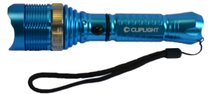
(Focus and Strobe)

Included in the range are the CLIPSTRIP™ range of rugged pivoting hand held pocket torches including the waterproof CLIPSTRIP™ AQUA and the Pivot33 LED torch with magnetic base.